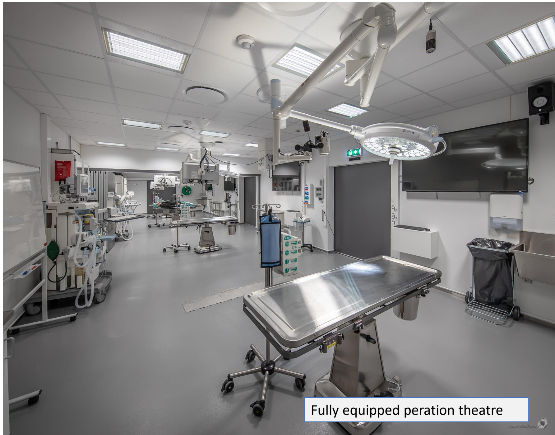
Fully equipped operation theatre