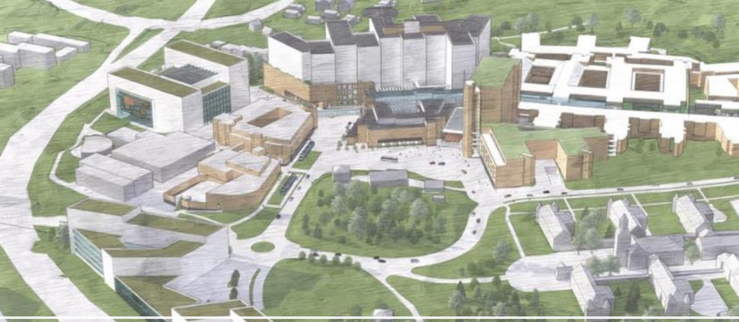
Oslo University Hospital